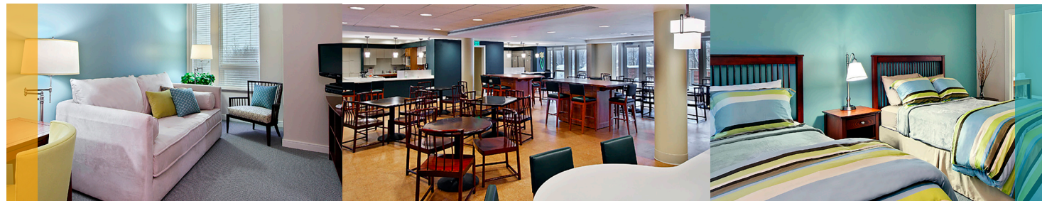
Astrazeneca Hope Lodge

Hospitality Homes provides a trained host who will offer you a clean and comfortable place to sleep and access to a bathroom. To stay at Hospitality Homes, you need to complete an application online or by phone. The approval process takes about two weeks. The cost is free with a suggested donation of $25/night to the host.